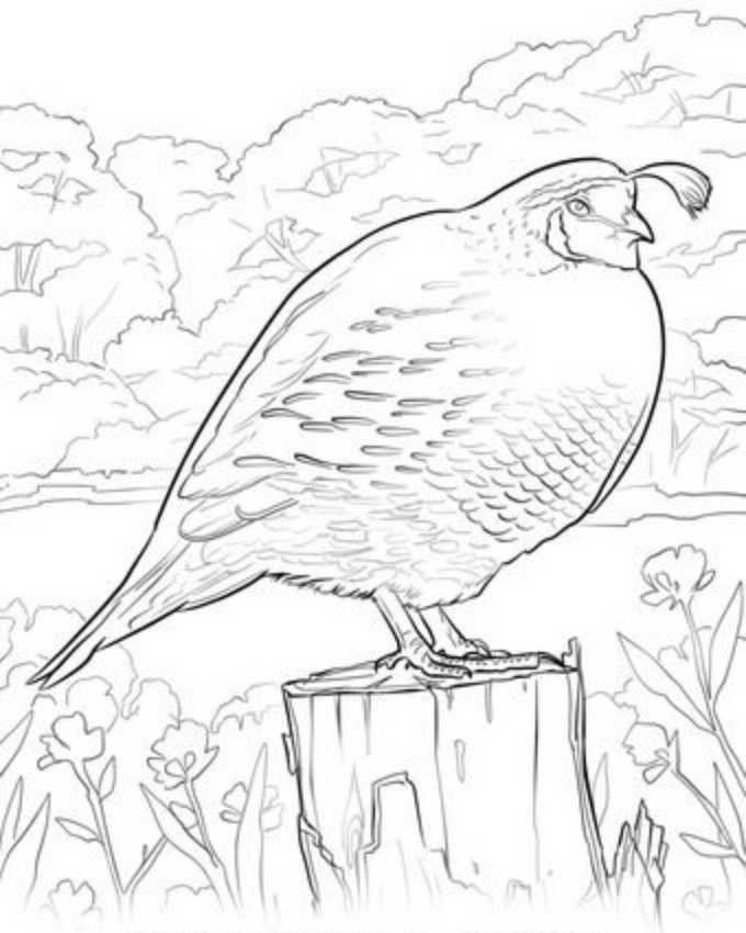
CALIFORNIA QUAIL CALIFORNIA STATE BIRD